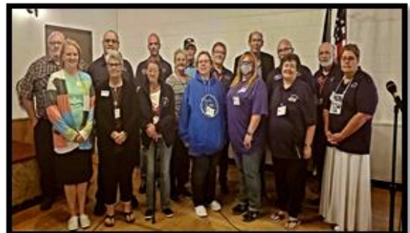
2020-2021 West Central Regional Charity Chairman